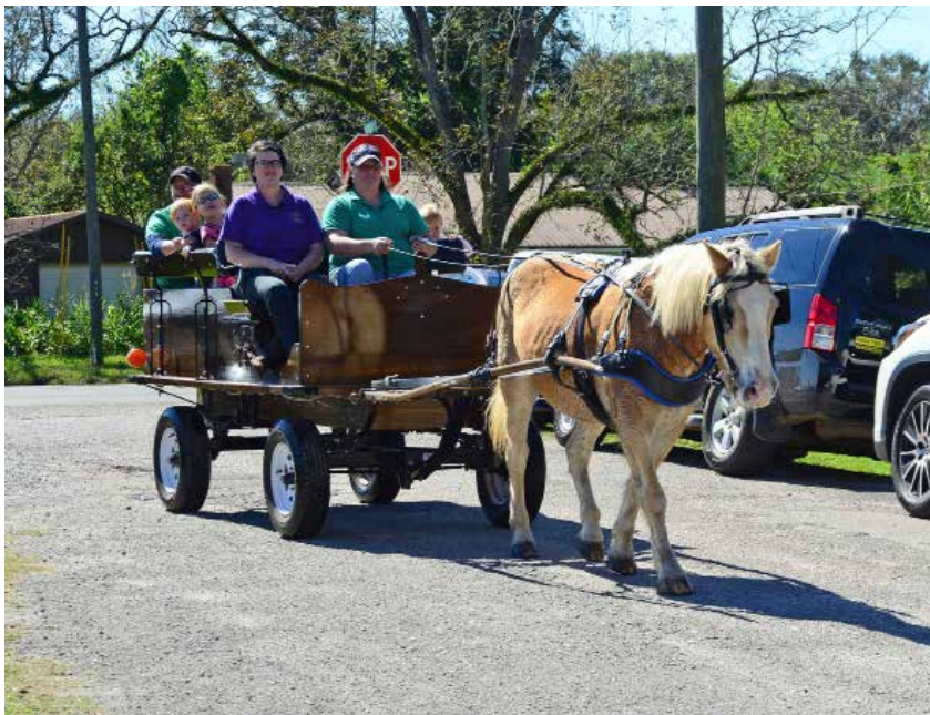
(Above) Visitors to the Baker Heritage Day Festival enjoy a horse-drawn cart ride Nov. 3. (Above right) Children and adults enjoyed the petting zoo at the April 21 pavilion fundraising event in the Heritage Park. (Right) The Museum's new logo was unveiled in January.