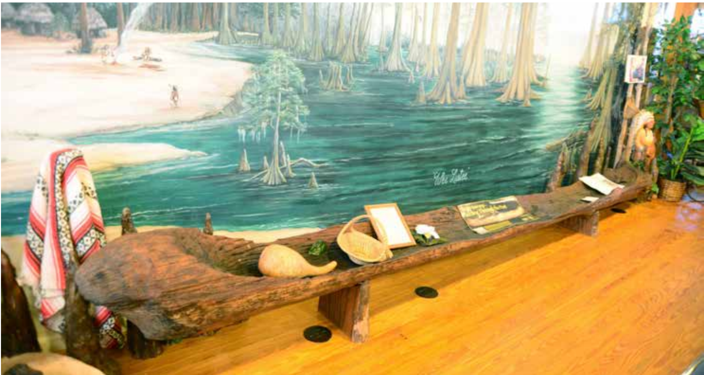
The Native American canoe on display in the Museum is an example of a traditional burnout canoe. It was found in White Western Lake in Bay County, Florida. Data from the Florida State Museum in Tallahassee indicates the radiocarbon age to be more than 1,200 years old.